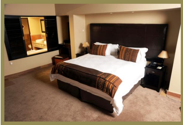
Deluxe Superior Suite

Rates are available on request from Banqueting Coordinator